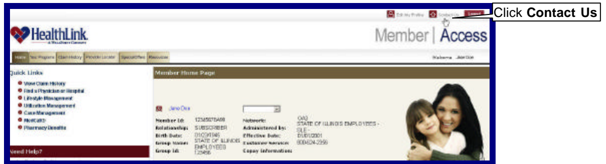
Figure 1. Contact Us–Home Page Link.

On the Authenticated Home Page, click the Contact Us link (Figure 1).