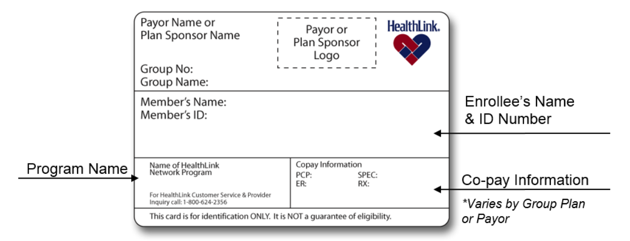
Figure 1 Front of HealthLink ID card

If Member presents an ID card with a HealthLink logo, the Claims address and Customer Service contact information will be noted on the ID card.