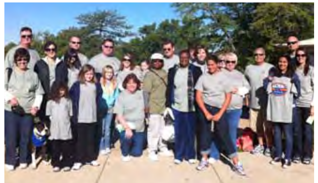
This year, HealthLink associates raised more than $1,800.00 for JDRF.