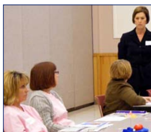
Office Staff Council Carbondale, IL

Many thanks to our Carbondale providers and office staffs who allowed us to photograph their meetings (see below). If you would like to participate in upcoming Office Staff Councils, please contact your Network Consultant.